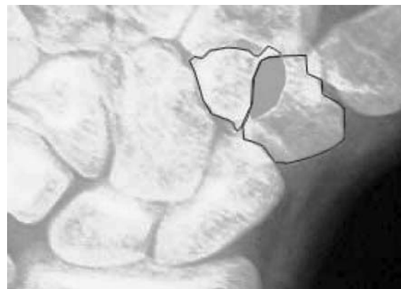
Fig. 2 An example of correct selection of carpal bones. Distal board is defined by metacarpal board, and overlapping area between trapezium and trapezoid (in gray) is calculated only once

We fitted to the entire data set with the linear model \text{Age} = \beta_0 + \beta_1 g + \beta_2 \text{Bo/Ca} where g is the dummy variable equal to 1 for boys and 0 for girls. Furthermore, the model was used to test the hypothesis of equal intercepts ( \beta_1 = 0 ) and slopes \beta_2 between boys and girls groups. Statistical analysis was performed with S-PLUS six statistical programs (S-PLUS 6.1 for Windows Professional edition Release 1). The significance threshold was set at 5%.