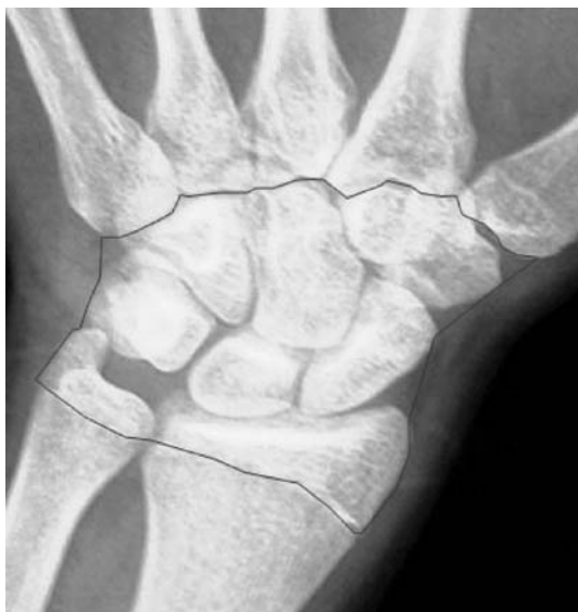
Fig. 1 An example of the carpal area selected using the polygonal lasso instrument of Adobe Photoshop 7 software

A simple linear regression model was considered to describe the relation between age and the ratio (Bo/Ca). Analysis of covariance (ANCOVA) was then applied to study how gender affects the growth of the ratio Bo/Ca in the boys and girls groups.